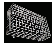
Wall Mount Wire Guard Part number: 2530050 Dimensions (mm) L x W x H 439 x 120 x 225