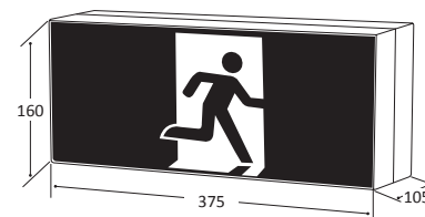
Dimensions (mm) Wall Mount