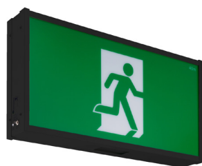
Theatre Jumbo Exit