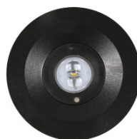
Lifelight Corridor Lens Emergency