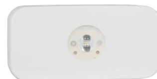
Lifelight SM Warehouse Lens