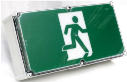
EXIT sign dimensions D = 130mm, W=560mm, H= 280mm